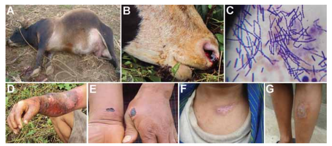
Figure 2. Signs of anthrax in infected animals (A–C) and humans (D–G), Bhutan, 2010. A) The carcass of an affected bull, showing bloating. B) Bleeding of unclotted blood from a cow's nostril. C) Rod-shaped Bacillus anthracis bacilli from 1 of the infected animals. Cutaneous anthrax causing severe inflammation of the arm (D) and typical black eschars on the hand and wrist (E), neck (scar) (E), and leg (G) of persons who had contact with B. anthracis –infected animals and carcasses.

In the remote villages of Bhutan, meat from dead animals is usually consumed by the villagers because they live in poverty and lack slaughterhouse facilities and education regarding diseases that might harm them. As in other remote villages, the farmers in Kaktong and neighboring villages affected by this outbreak were unaware of anthrax in animals and of the public health implications of this disease. Our investigation showed that all affected persons had handled and/or consumed meat from animals with suspected or confirmed anthrax. While we were conducting the outbreak investigation and control programs, we held an education meeting to make villagers and students aware of the risks associated with anthrax. The villagers cooperated in response activities, including the disposal of carcasses