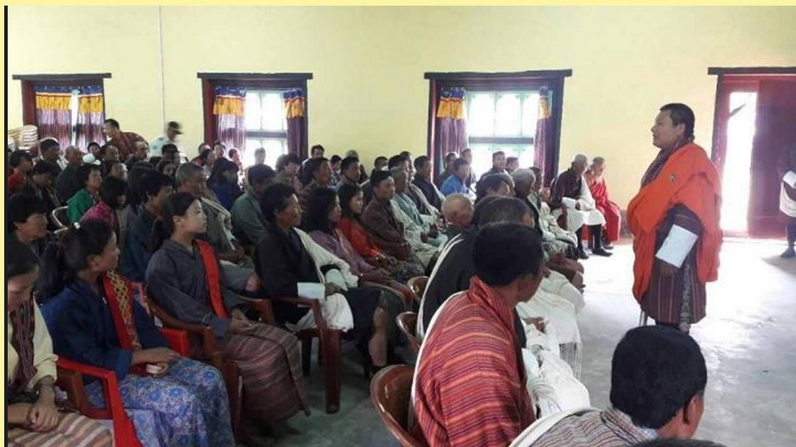
Sanam Lyonpo interacting with livestock owners in Doteng geog during one of the advocacy campaigns

Ring vaccination, treatment of affected animals, movement control of livestock and dairy products out of the affected areas and advocacy are implemented by the team to control the outbreak and prevent its spread to unaffected areas.